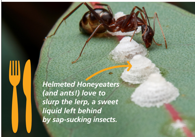
Helmeted Honeyeaters (and ants!) love to slurp the lerp, a sweet liquid left behind by sap-sucking insects.

What kinds of sugar rich flowers and small insects do you think Helmeted Honeyeaters might snack on? Draw these sweet treats around the bird.