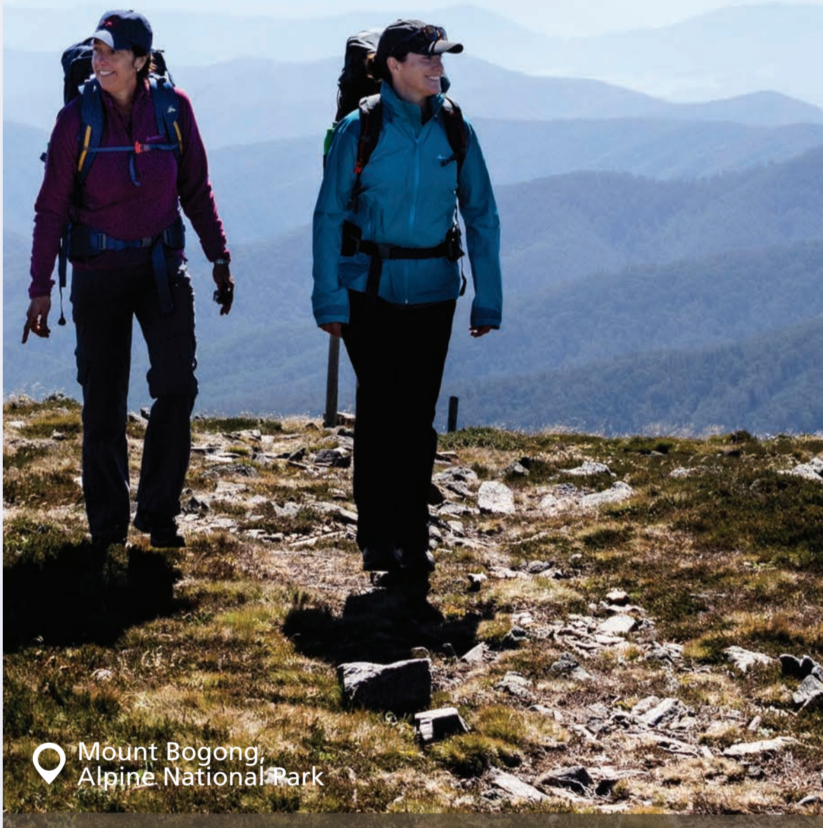
Mount Bogong, Alpine National Park

See spectacular views at Victoria's best summits and lookouts.